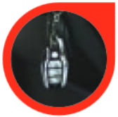
Central Lock Anti-Theft Alarm