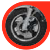
Brakes Disc/Drum & e-ABS

MOTOR BATTERY CHARGING TIME RANGE/CHARGER VOLT AH TOP SPEED CLIMBING CAPACITY MAX LOADING CAPACITY SPEEDOMETER INDICATOR