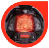
Stylish Back Light