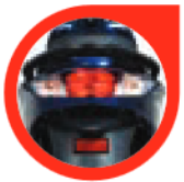
Stylish Back Light