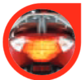
Stylish Back Light