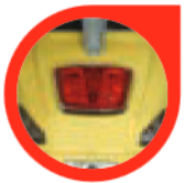
Stylish Back Light