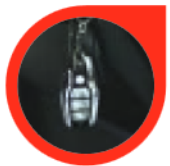
Central Lock Anti-Theft Alarm