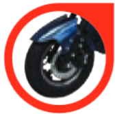
Brakes Disc/Drum & e-ABS

MOTOR BATTERY CHARGING TIME RANGE/CHARGER VOLT AH TOP SPEED CLIMBING CAPACITY Max loading capacity SPEEDOMETER INDICATOR