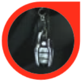
Central Lock Anti-Theft Alarm