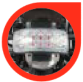
Stylish Back Light