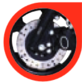
Brakes Disc/Drum & e-ABS

MOTOR BATTERY CHARGING TIME RANGE/CHARGER VOLT AH TOP SPEED CLIMBING CAPACITY CONTROLLER