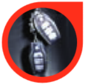
Central Lock Anti-Theft Alarm